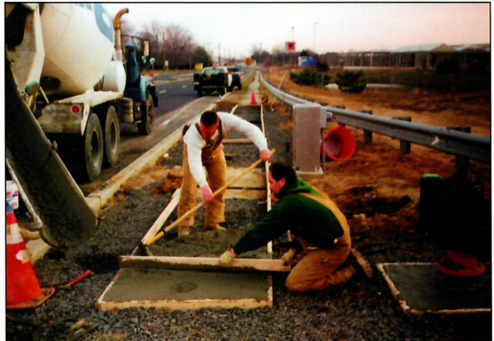
West Bay personnel complete concrete placement in conjunction with water main installation.

storm drainage and a pedestrian bridge installation.