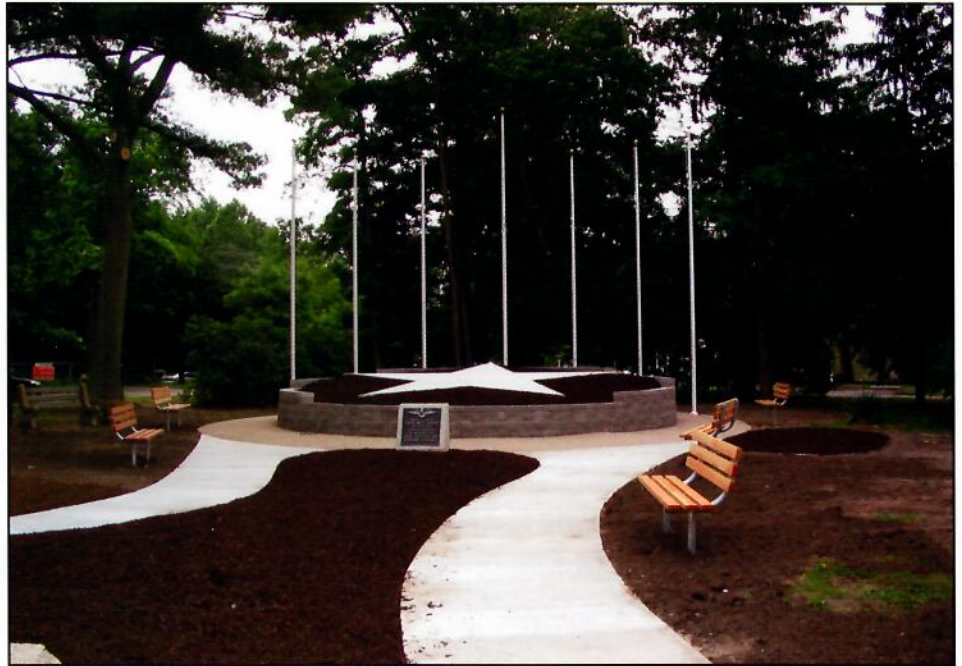
Veterans Memorial Park constructed by West Bay Construction in Pleasantville.

Within two years, the firm expanded its market to also include work in Gloucester, Cumberland and Camden counties. This work was often performed as a subcontractor and included the construction of timber bridge foundations, test pile installations,