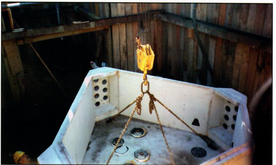
Junction box installed by West Bay for PSE&G.