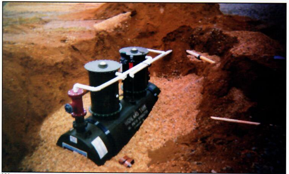
Water separator installed at the NJ National Guard facility in Vineland.